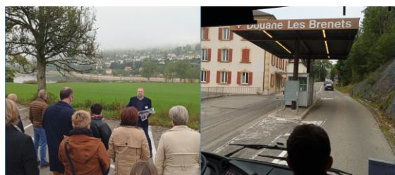
The visit around Lac des Brenets, which straddles the two countries, with a presentation of the issues relating to the preservation of water resources between France and Switzerland, then the Brenets border crossing point.

[...] These discussions can be (re)watched on the MOT's YouTube channel, as can the meetings of its bodies, which presented an assessment of the past year, approved the activity and financial reports, and elected the new representatives on the association's Board. More info [FR]