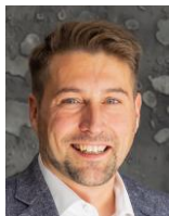
Uwe Conradt Vice-President of the SaarMoselle Eurodistrict and Mayor of Saarbrücken