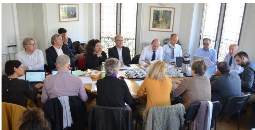
Meeting on building the network of Cross-Border Cooperation Strategies.

** Agence d'Urbanisme Atlantique et Pyrénées – the Atlantic and Pyrenees Urban Planning Agency